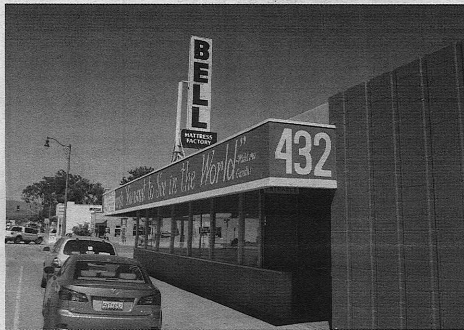
Outside the Bell Mattress Factory, Ventura, CA.

Gallery Space where tenants can have exhibitions. Every other month there is a Gallery Night with discussions and classes offered. I wandered throughout the several floors and sections talking with many of the artists who heartily expressed how much they enjoy working in the space. "It is like camp," one artist told me. Tenants are respectful of each other's privacy and at the same time available for socializing and helping one another.