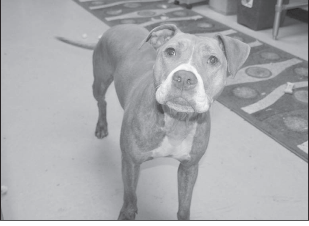
Brink Dakota home today!

The Yonkers Animal Shelter has a number of pets available for adoption. Dakota is a beautiful, young dog who was found tied to a pole in Yonkers about three or four weeks ago. She was very frightened the first few days she was at the shelter, but once she realized she was in a warm and safe place, she settled right in. She's a good-size dog, maybe 50 to 52 pounds, and probably less than 2 years old. Dakota is friendly toward all dogs and