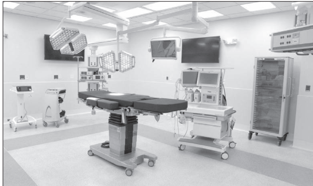
A new emergency room at White Plains Hospital.

White Plains Hospital has long been a regional leader in the field of surgery, and was one of the first hospitals in Westchester to offer robotic surgery. And as of Jan. 1, it will have five brand-new, state-of-the-art operating rooms open and ready for patients.