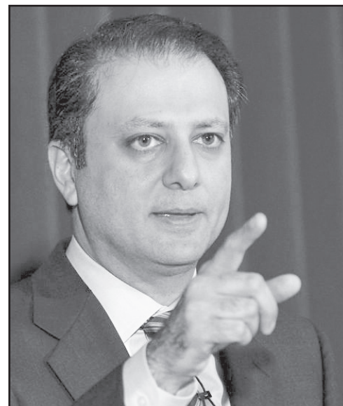
U.S. Attorney Preet Bharara