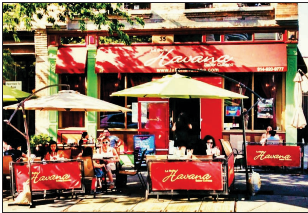
The Belle Havana restaurant is one of the many locations participating in Yonkers International Restaurant Week.